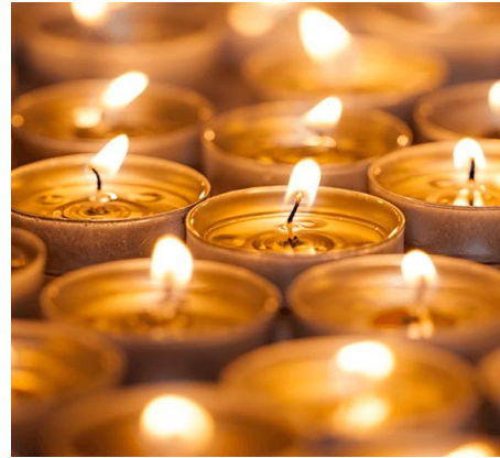
Sparkle and Shine! (Autumnal Changes, Festivals- Diwali, Bonfire night, Harvest and Christmas)