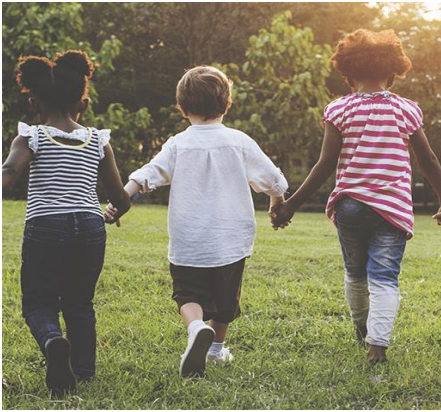
Me and My Community! (People who help us, me myself and I, 5 senses, my family!)