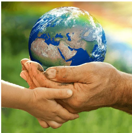
Big Wide World! (Transport, maps, different environments)