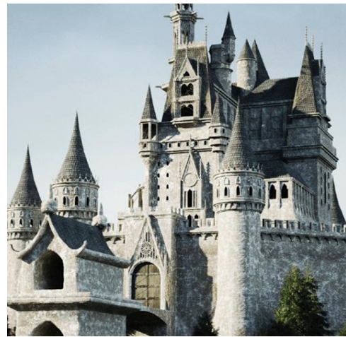
Once upon time! (Traditional tales, Spring time, Exploring old and new)